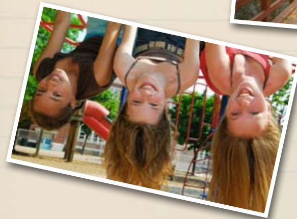
Active and having fun