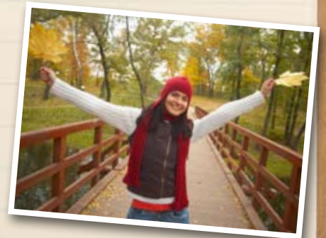
Full of life